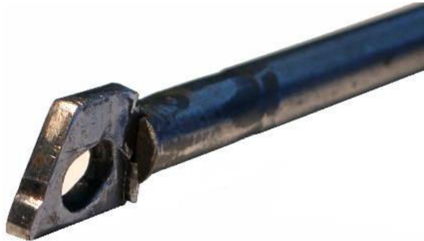
Fig 4 USGI Redesigned Spring Guide - Weight varied depending on manufacturer. Average 59 grams to 65 grams

Recognizing the short comings of the flat stamped spring guide, the Army redesigned the part in an effort to offer more precise spring alignment by machining round drill rod and welding or brazing a cut off mag catch into a slot in the drill rod. The opposite end was tapered as it had been with the original design. Although the flat spring guide shaft was heat treated prior to welding, it was not re-heat treated to harden the mag catch who's metal had been softened during the welding/brazing process. This resulted in a mag catch which suffered excessive wear prematurely. The design was a fast and easy way to produce a NM spring guide that was better but not long lasting. We suspect that, early on, many NM spring guides were made this way.