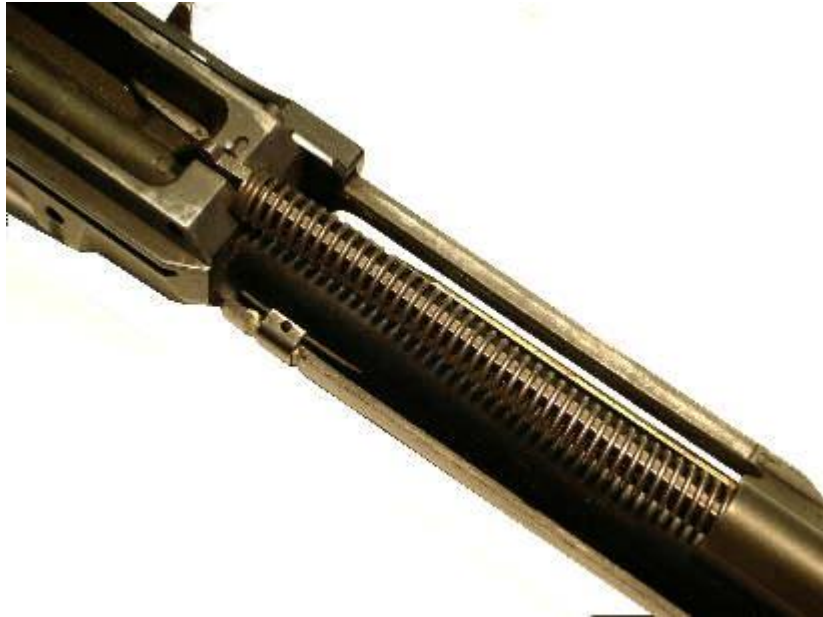
Fig. 8 Sadlak NM Spring Guide Installed