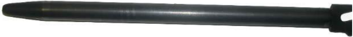
Fig 6 TRW NM Spring Guide

Brookfield Precision Tool further refined the Army Marksmanship Training Unit (AMTU) redesign by offering a spring guide with a far more accurate fully machined magazine catch instead of a stamped catch like the GI version. Although the machined mag catch was still welded/brazed to the shaft as it had been on the hybrid USGI model, the entire spring guide was heat treated after the welding which resulted in a much more durable magazine catch. Brookfield also milled four flats into the shaft to reduce both weight and friction and to give some room for debris in the event dirt entered the spring area.