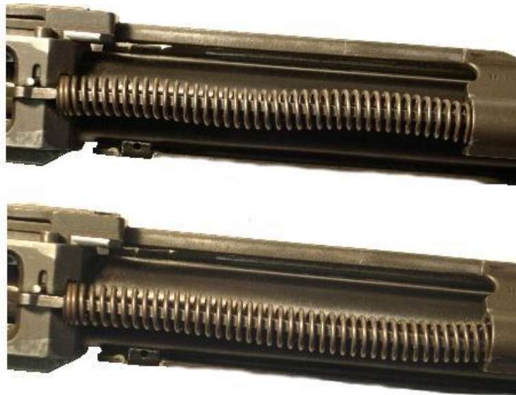
Fig 3 USGI Spring Guides Installed

The spring guide was meant to hold the spring in place, not guide the op rod. When the spring and stamped metal spring guide were installed in the op rod, there was too much "play" to maintain true spring alignment as demonstrated in this photograph. The problem is simple. They used a rectangular part inside the round shape of the spring. This is why the spring, when compressed, will bunch up as shown in the photo.